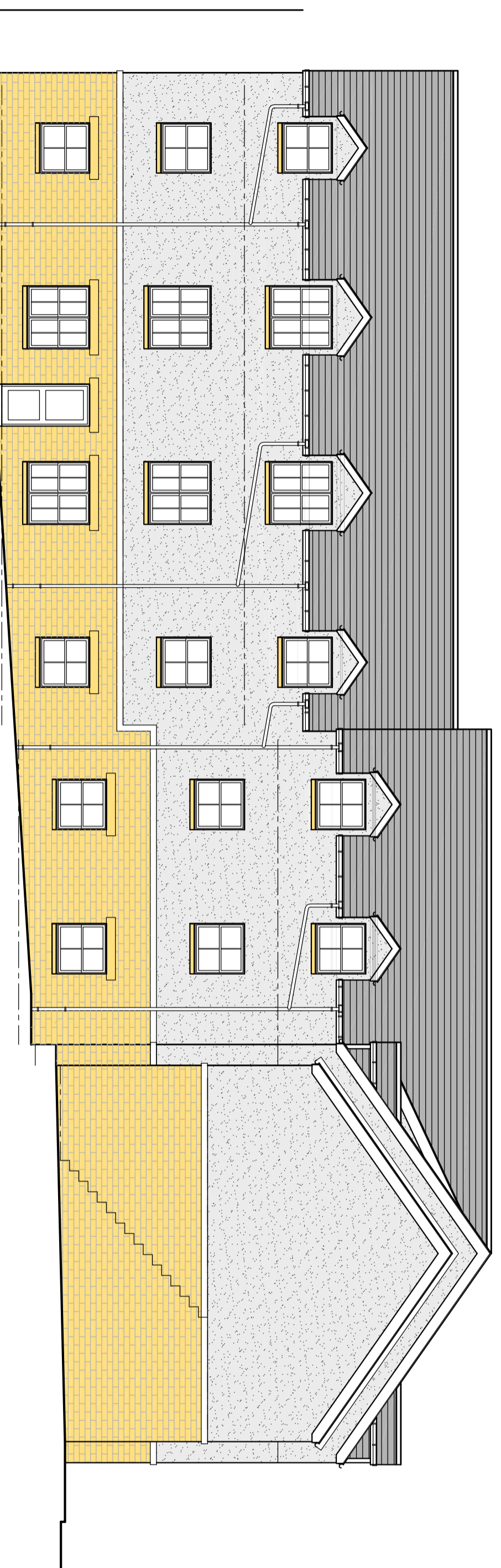
WEST ELEVATION SCALE 1 : 100